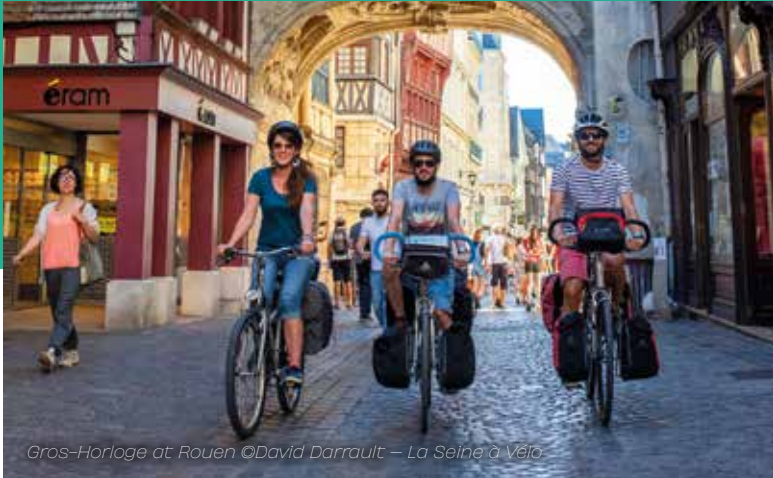
Gros-Horloge at Rouen

Departure : Rouen city centre Access : by TGV or TER station in Rouen and by BUS to Duclair. Distance : ~ 34 miles (55 km)