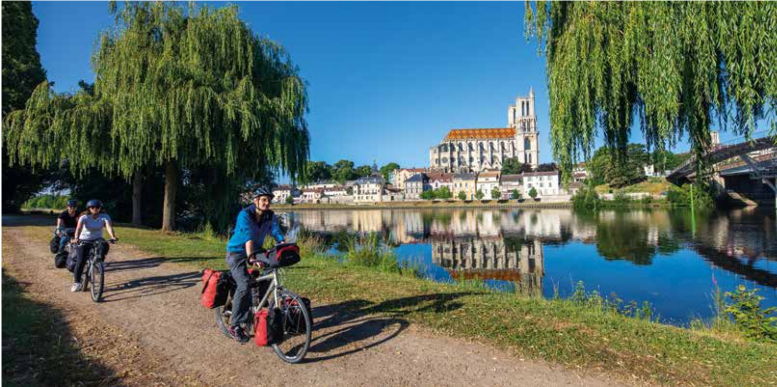
Collegiate Church of Mantes-La-Jolie