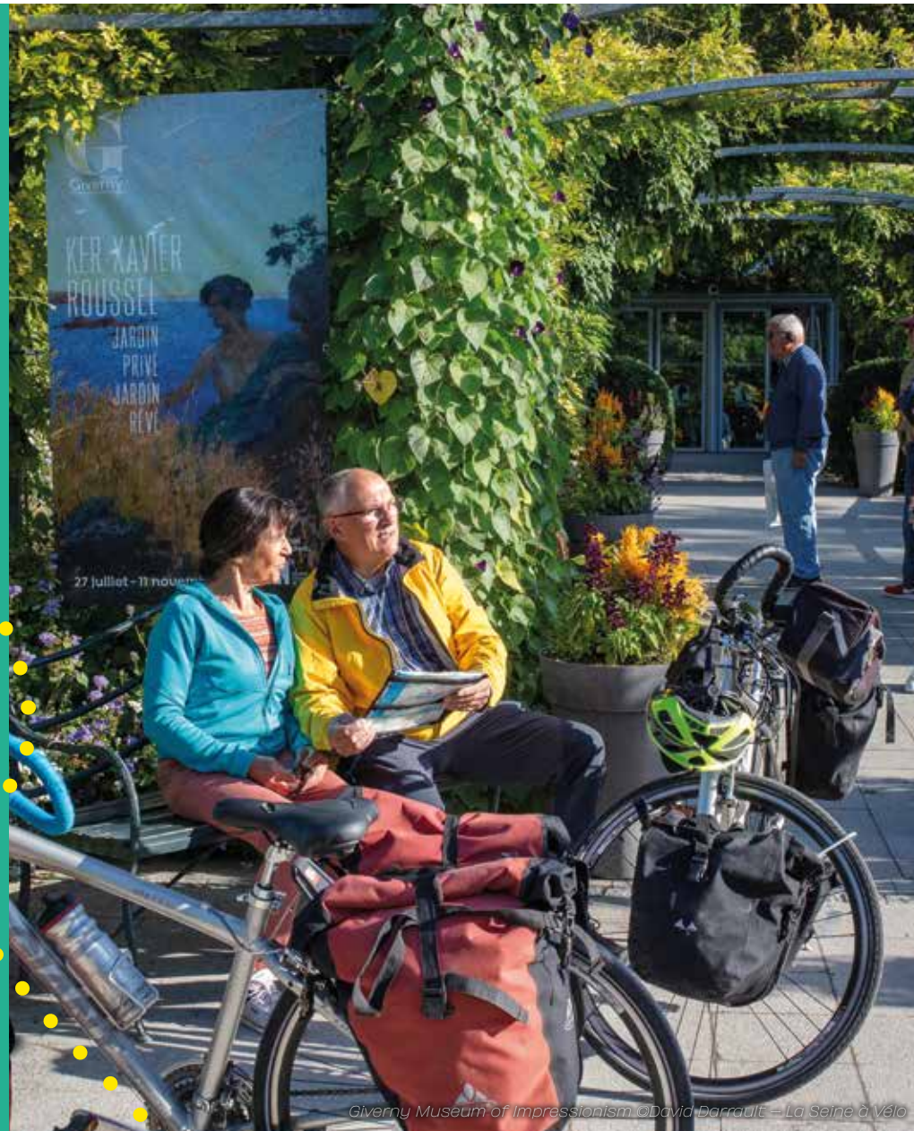
Giverny Museum of Impressionism ©David Darrault – La Seine à Vélo