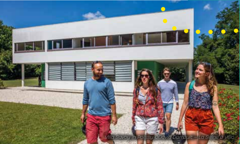
Villa Savoy in Poissy ©David Darrault – La Seine à Vélo

The Seine à Vélo route takes in some outstanding heritage sites that span France's history, from epic religious landmarks such as the cathedrals of Paris and Rouen , ancient abbeys such as Jumièges and Saint Wandrille , the châteaux of La Roche Guyon , Bizy , Château-Gaillard and the DDay Landing Beaches as the historical highlights of a fascinating past. The cycle route also encompasses famous UNESCO World Heritage sites such as the Cathedral Basilica of Saint-Denis and its royal necropolis , the Villa Savoye in Poissy, a contemporary architectural masterpiece by Le Corbusier. The long-distance cycle route ends in two iconic cities: UNESCO listed Le Havre , referred to as the reconstructed city and Deauville , a 19th century trendy seaside town famed for its glorious sandy beach and stylish, elegant villas.