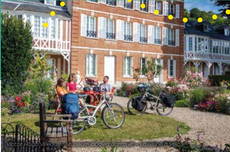
Victor Hugo Villequier Museum

Departure : Abbey of Jumièges / town centre of Jumièges Access : BUS in Jumièges and TER in Le Havre Distance : ~ 53 miles (85 km)