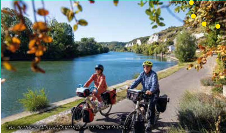
Les Andelys ©David Darrault – La Seine à Vélo

Departure : Haute-Isle church / La Roche-Guyon town centre Access : Bonnières SNCF railway station (TER and Transilien J) Distance : ~ 18.5 miles (30 km)