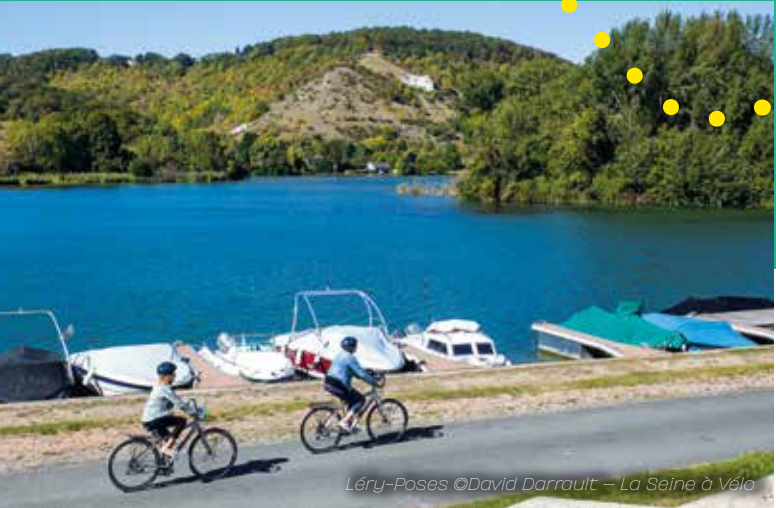
Léry-Poses