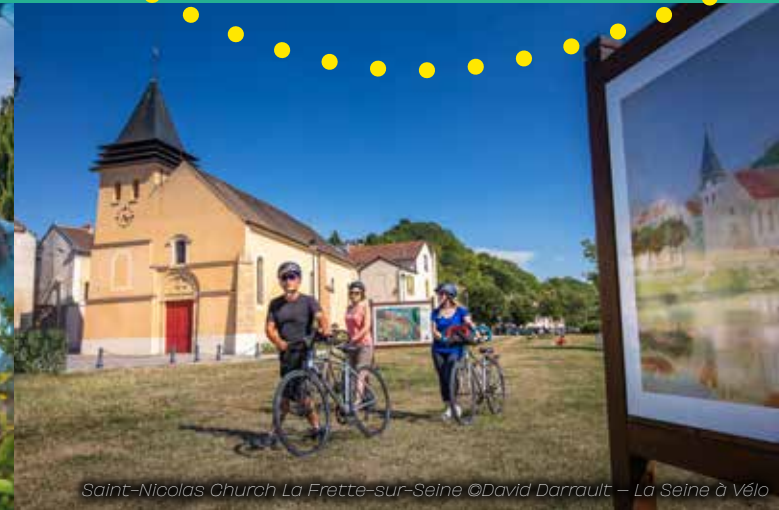
Saint-Nicolas Church La Frette-sur-Seine