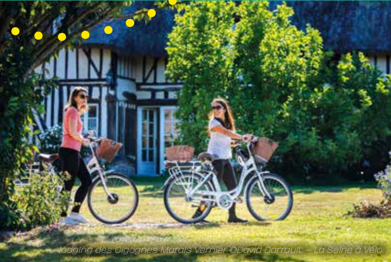
lodging des Oigognes Marais vernier