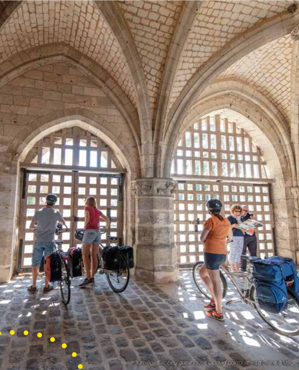
Jumièges Abbey gatehouse