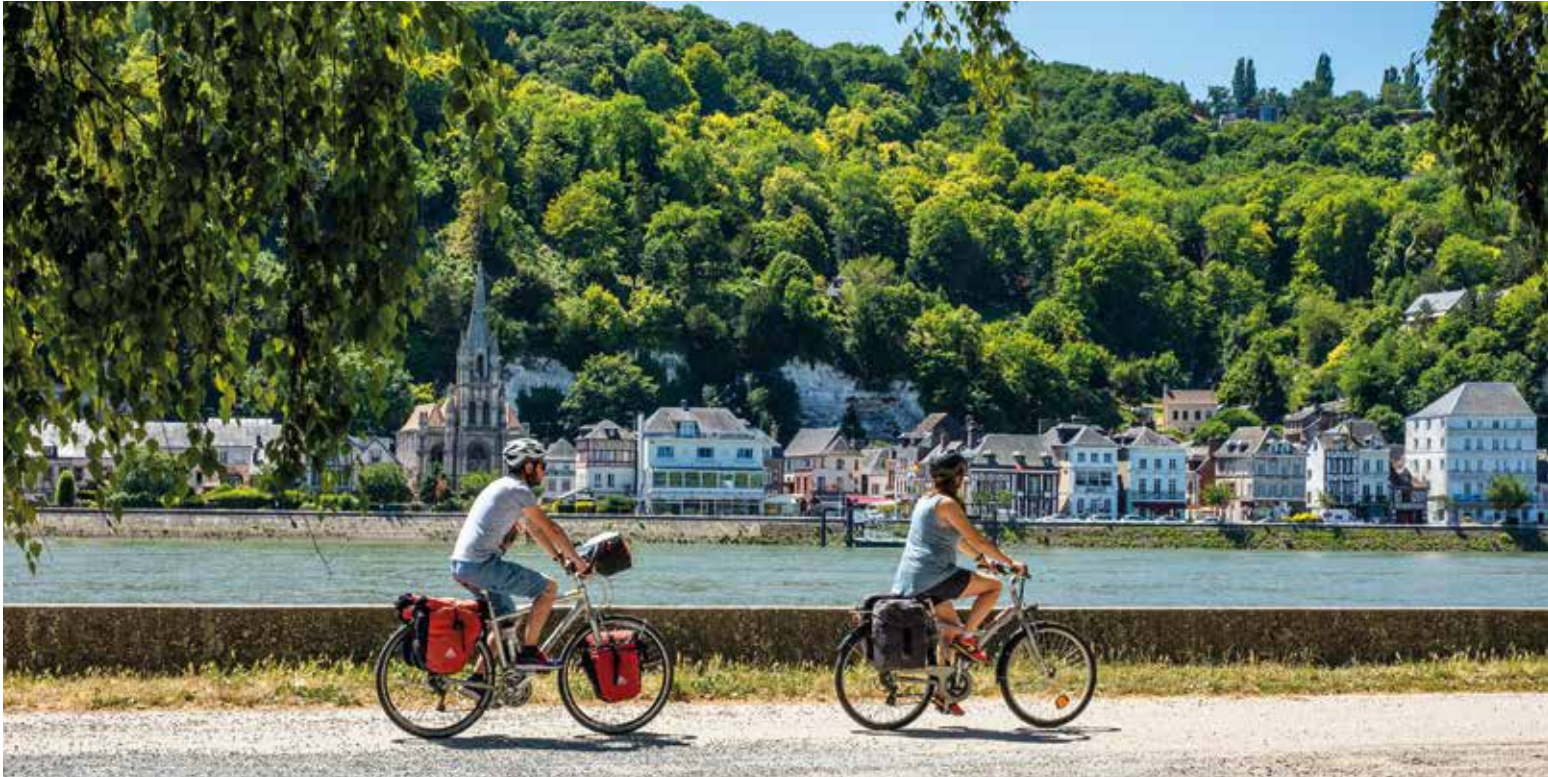
View of La Bouille