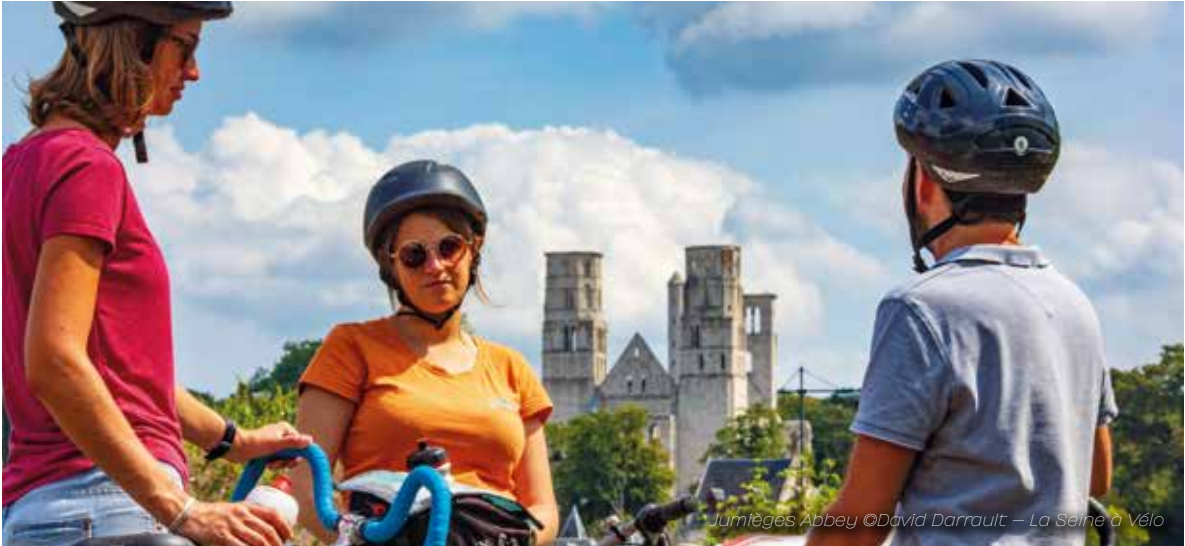
Jumièges Abbey

Be prepared to enjoy endless natural beauty on the Seine à Vélo itinerary as the journey takes you through the wonderful scenery of the state forest of Saint-Germain-en-Laye , the Norman Seine River Meanders Regional Nature Park and the vast Seine estuary that leads to Le Havre harbour. The route crosses some of the most treasured preserved areas such as Port îlon and the Guernes loop located in the French Vexin Regional Nature Park , or the Grande Noé bird reserve hosting colonies of protected bird species since 1987 at the confluence of the Seine, Eure and Andelle rivers. A stop at Val-Saint-Martin , at Orival , at Poses and at Les Andelys offer superb views of the dramatic cliffs overlooking the banks of the Seine and a real sense of getting away from it all.