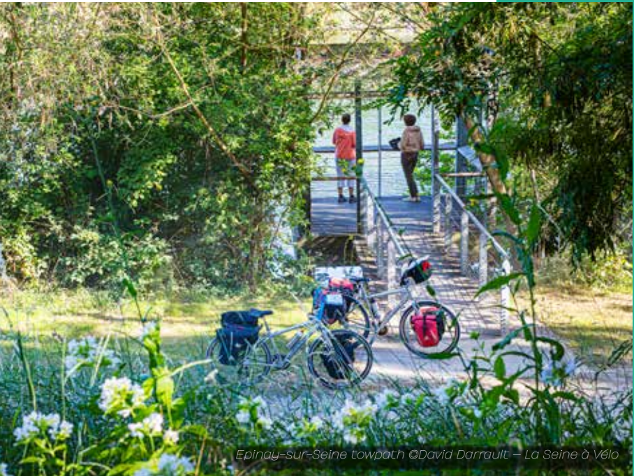
Epinau-sur-Seine towpath