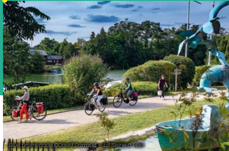
Blue promenade