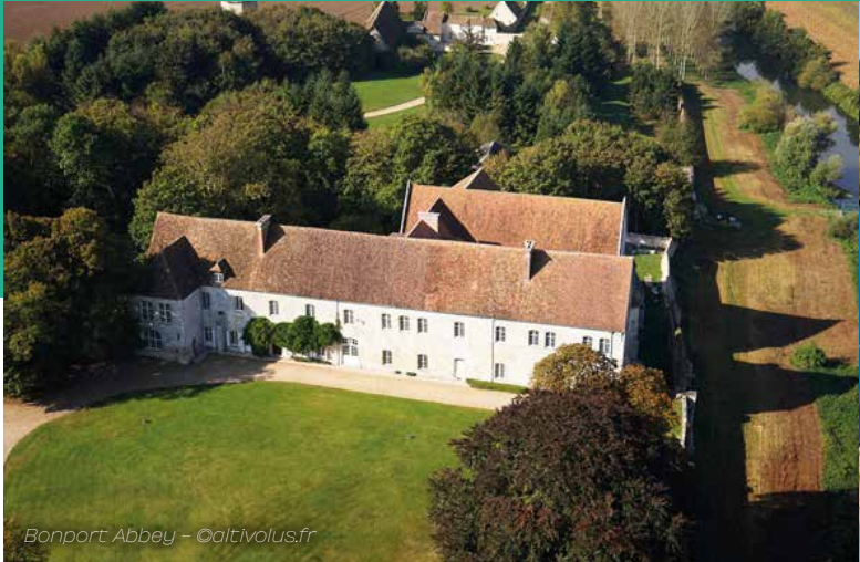
Bonport Abbey