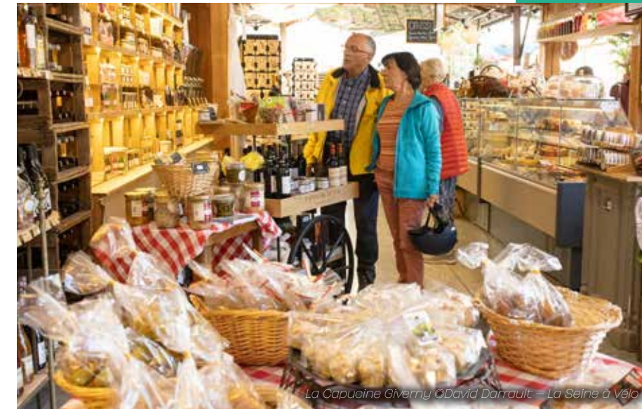
La Capucine Giverny ©David Darrault – La Seine à Vélo

Plenty of sights along the routes appeal to water sports enthusiasts, allowing numerous stops at ponds, lakes, water activity centers or marinas. The quays of Rouen host magnificent tall ships during The Armada, a key event in the international sailing calendar . The next edition of this major maritime and festive gathering will take place in 2023. The route is scattered with sites that capture the river's industrial history. In the riverside town of Conflans-Sainte-Honorine , the fabulous Museum of Inland navigation and waterways (musée de la batellerie et des voies navigables) provides a deep insight into the role played by the Seine river and the Saint-Denis Canal in industrial times. In Le Havre and Deauville , where the trail ends, you can revel in the delight of iconic harbours, nestled in timeless landscapes.