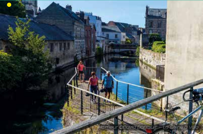
Harfleur