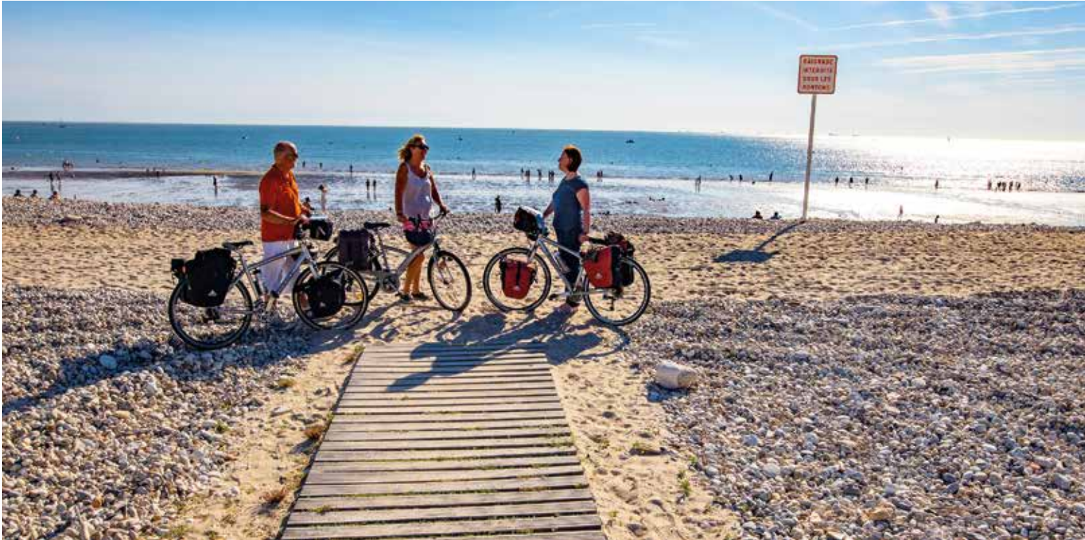
Havre Beach