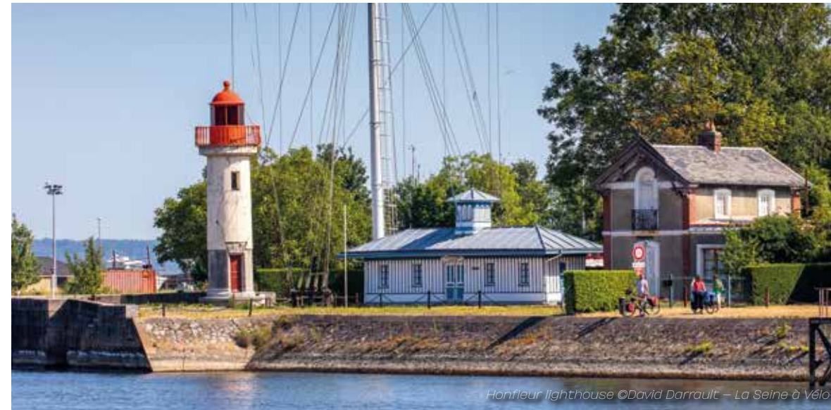
Honfleur lighthouse