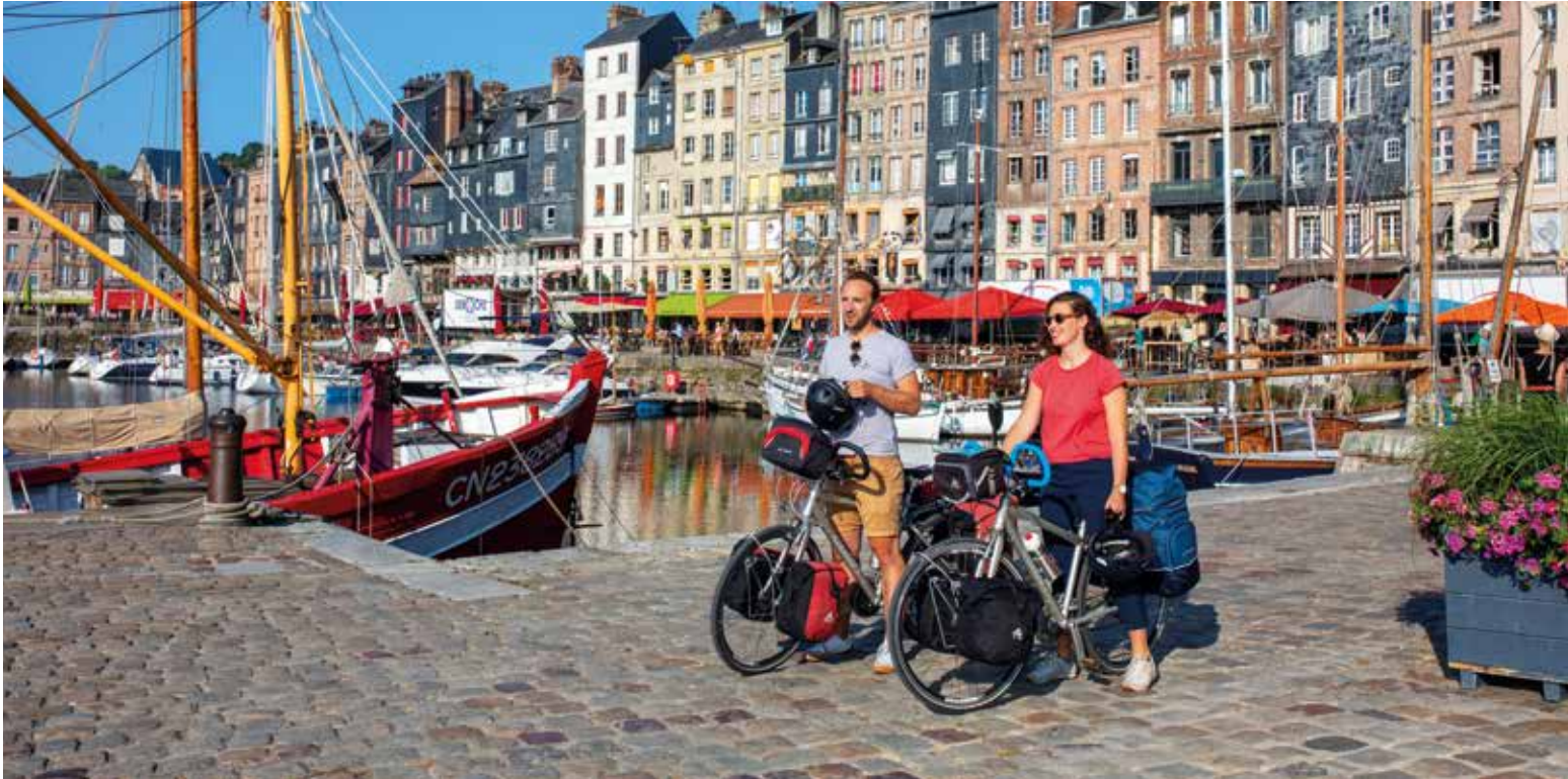
Vieux Bassin in Honfleur