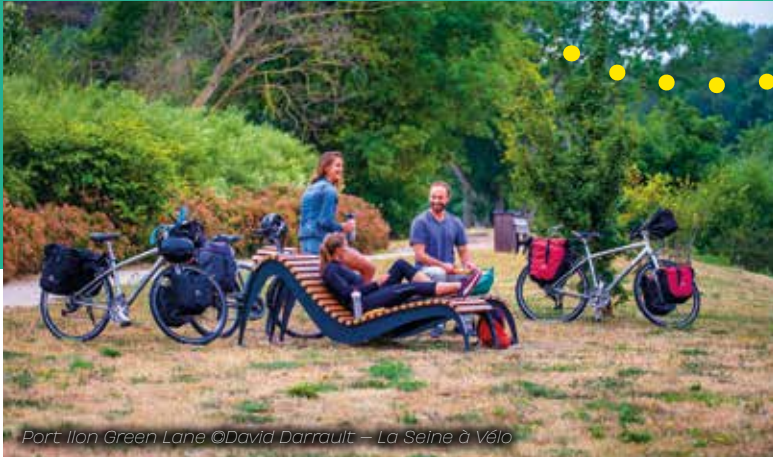
Port Ilon Green Lane