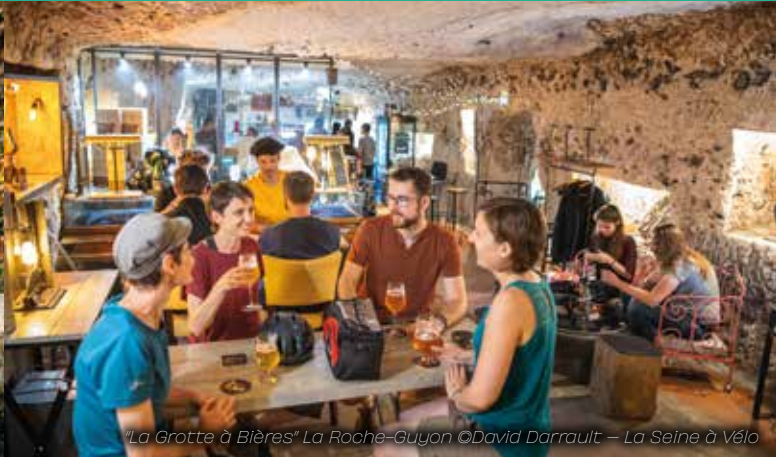
La Grotte à Bières" La Roche-Guyon