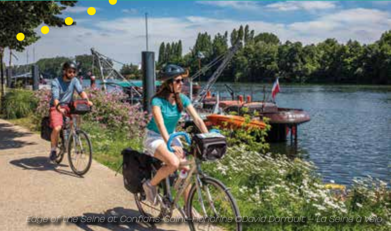
Edge of the Seine at Conflans-Saint-Honorine