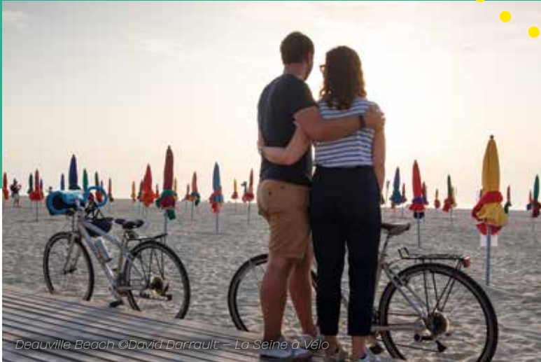
Deauville Beach

Departure: Abbey of Jumièges / town centre of Jumièges Access: BUS in Jumièges and TER in Pont l'Evêquet and Deauville Distance: ~ 71,5 miles (115 km)