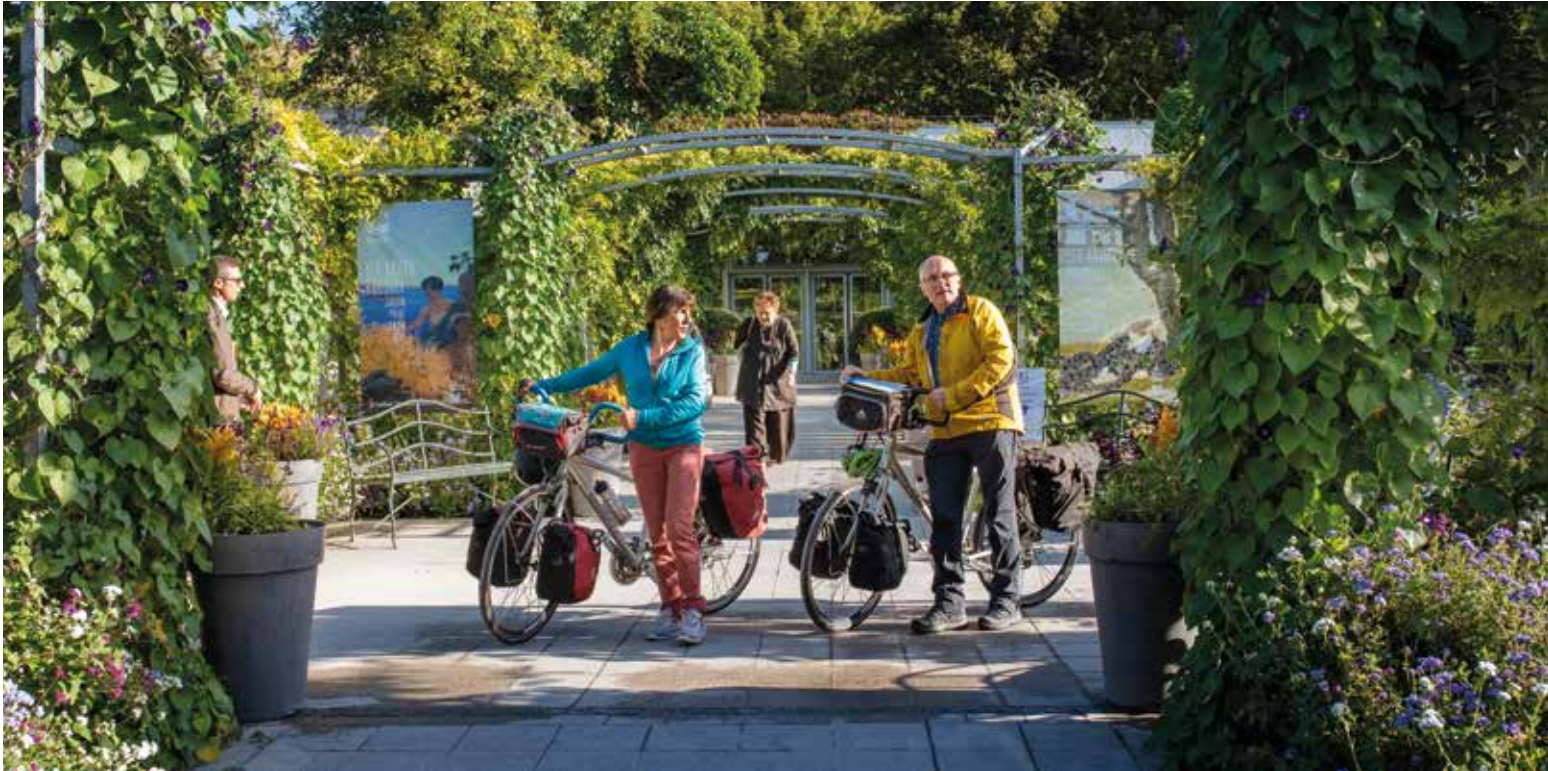
Giverny Museum of Impressionism ©David Darrault – La Seine à Vélo