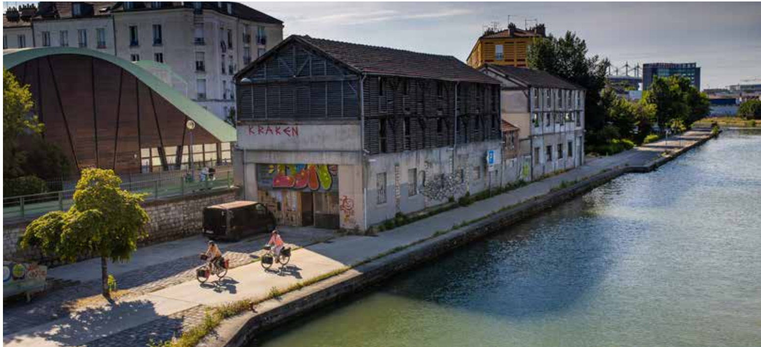
Bateaux Lavois Canal Saint-Denis