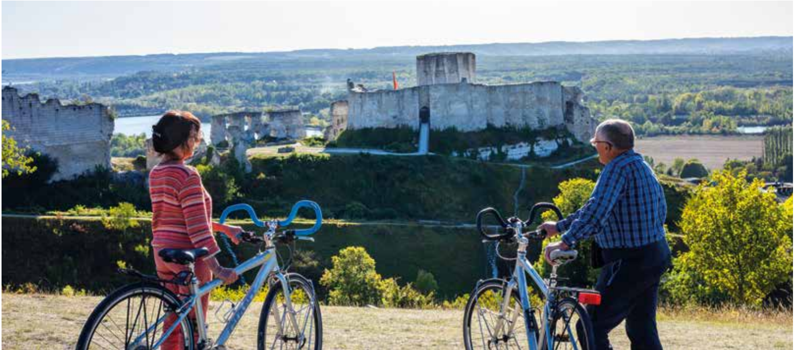
Château Gaillard Les Andelys

From the church Saint-Sauveur in Les Andelys, the route heads towards Rouen following the Seine's meandering banks. Take a quick pitstop in the former boating village of Poses to discover the intriguing Seinoscope, a unique way of observing fish swimming upstream on the river whatever the season. Right up to Rouen, this quiet and picturesque section of the route runs along a towpath